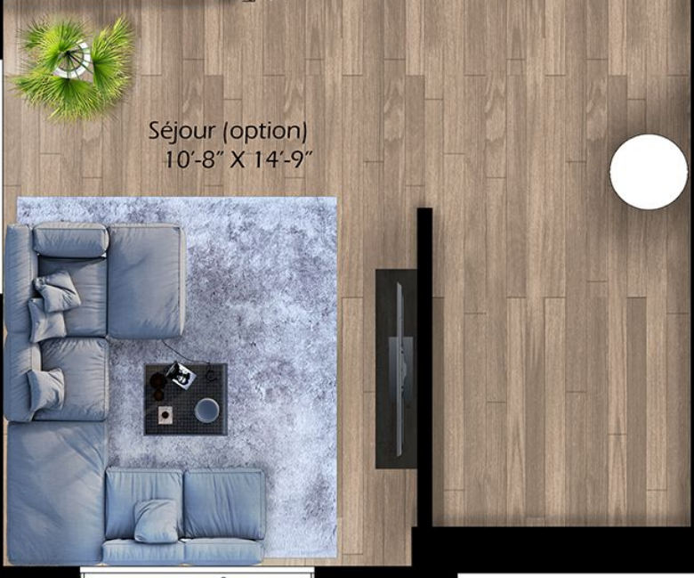
Séjour (option) 10'-8" X 14'-9"