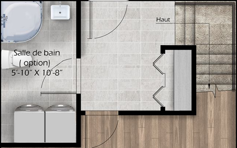
Salle de bain (option) 5'-10" X 10'-8"