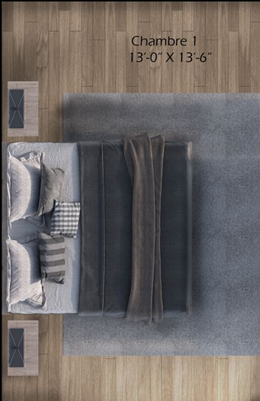
Chambre 1 13'-0" X 13'-6"