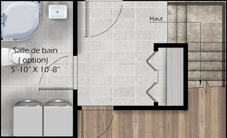
Salle de bain (option) 5'-10" X 10'-8"