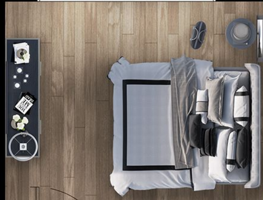
Chambre 3 8'-9" X 8'-9"