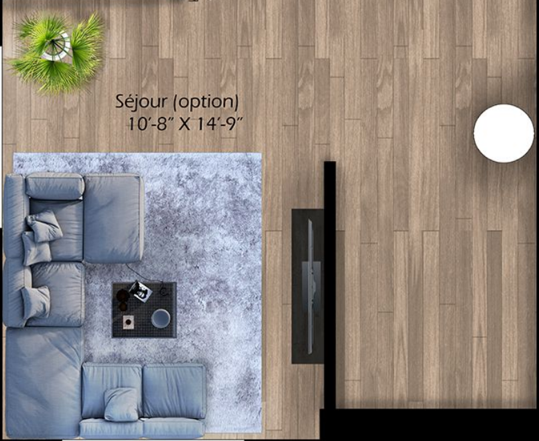
Séjour (option) 10'-8" X 14'-9"