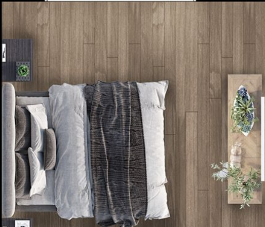
Chambre 2 8'-9" X 10'-0"